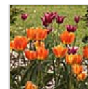
Map: Public gardens