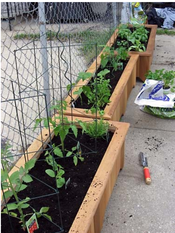
Eleanor Justice's "dream garden" was installed Tuesday.